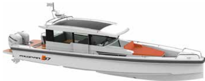
Axopar 37 Cabin