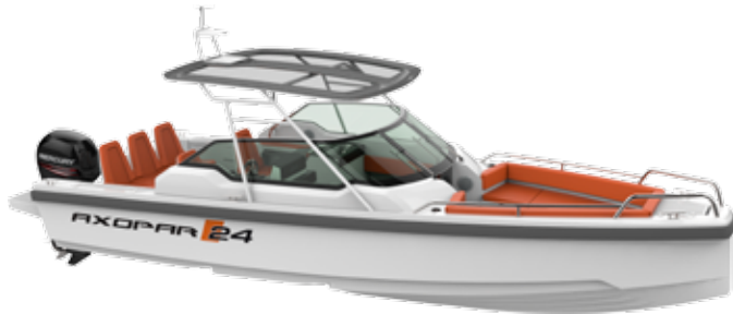
Axopar 24 T-Top