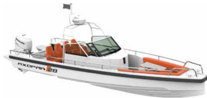
Axopar 28 Open/OC