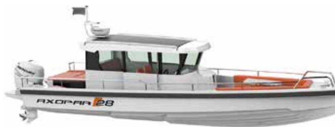
Axopar 28 AC