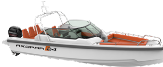
Axopar 24 Open