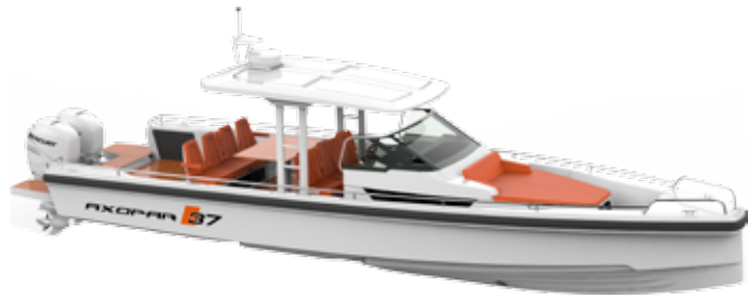
Axopar 37 T-Top