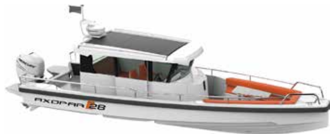
Axopar 28 Cabin