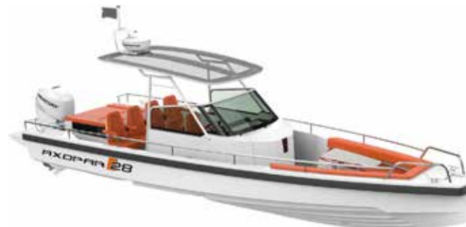
Axopar 28 T-Top