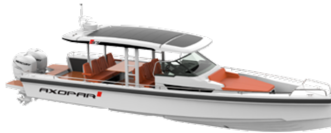
Axopar 37 Sun-Top