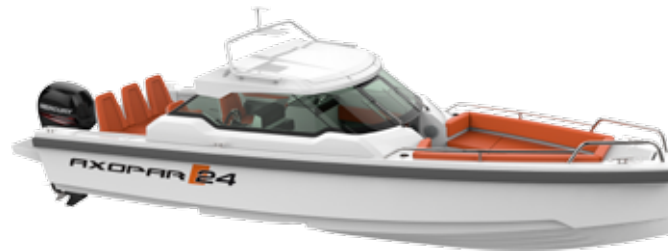
Axopar 24 HT